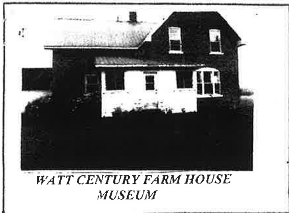
WATT CENTURY FARM HOUSE MUSEUM